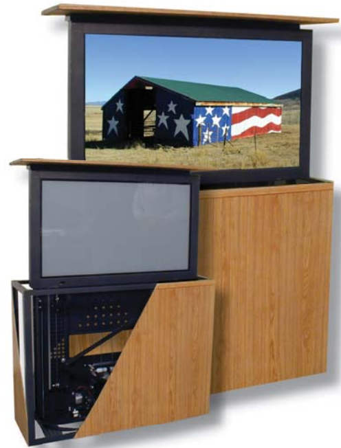
Shown with OPT-20 Enclosure Frame Wood paneling not included